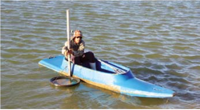
Brazilian farms closely monitor the feeding behavior of shrimp.

and U.S. $2.8 million in 1998 to 58,455 mt and $235.9 million in exports, respectively, in 2003 (Figure 1).