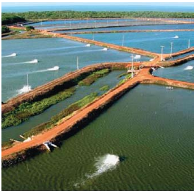
Brazil's shrimp farms have a history of high productivity.